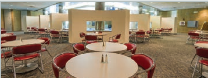
Cafeteria offering hot breakfast and lunch, as well as catering for meetings and events