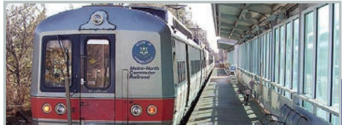
Metro-North train station and bus stops on campus