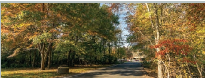
Country-like setting including outdoor lunch areas and scenic jogging trails